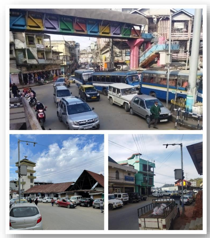
Traffic Junction & Connecting Roads

With Videonetics unified solution, city officials can efficiently keep 24x7 watchful eye on the city, from the Integrated Command & Control Center. Hence, empowering them to stay abreast of every movement/activity, facilitating law & order, traffic management, municipal operations and providing wealth of data intelligence under one roof.